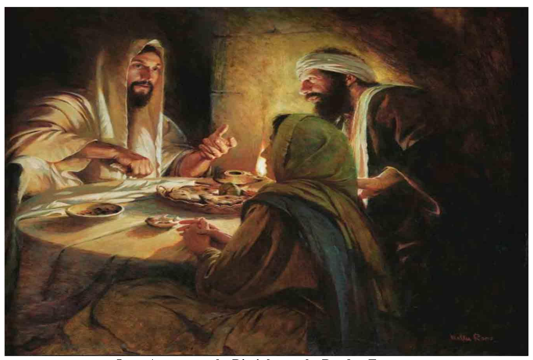
Jesus Appears to the Disciples on the Road to Emmaus Luke 24:13-35