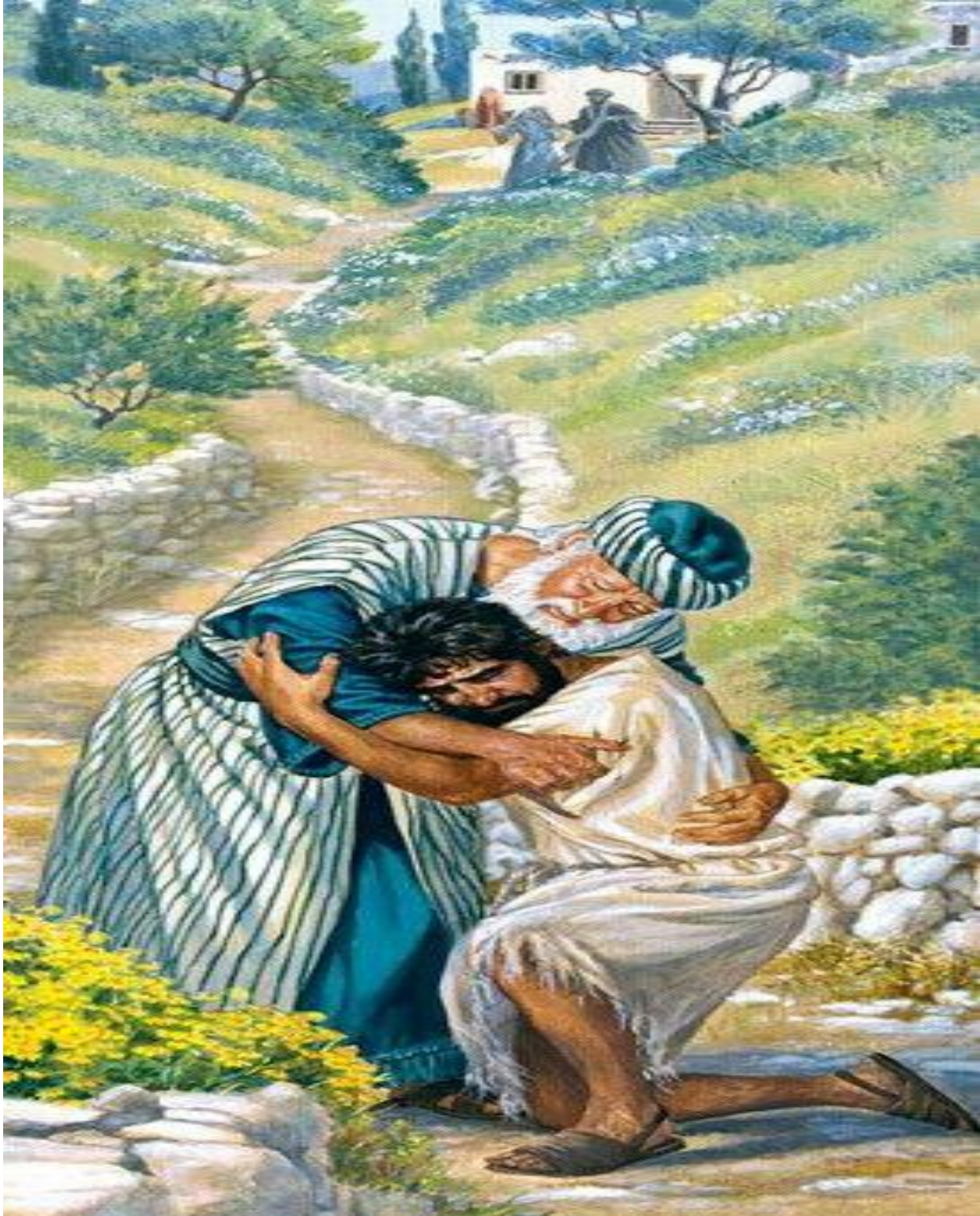
The Parable of the Prodigal Son Luke 15:11-32